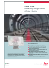
SiRail Suite Software package for the railway industry

Leica Geosystems AG www.leica-geosystems.com