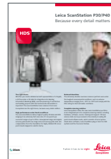
Leica ScanStation P30/P40 Because every detail matters