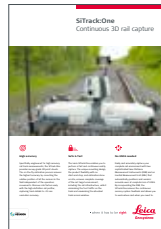
SiTrack:One Continuous 3D rail capture

Illustrations, descriptions and technical data are not binding. All rights reserved. Printed in Switzerland – Copyright Leica Geosystems AG, Heerbrugg, Switzerland, 2015. 847359en – 06.16