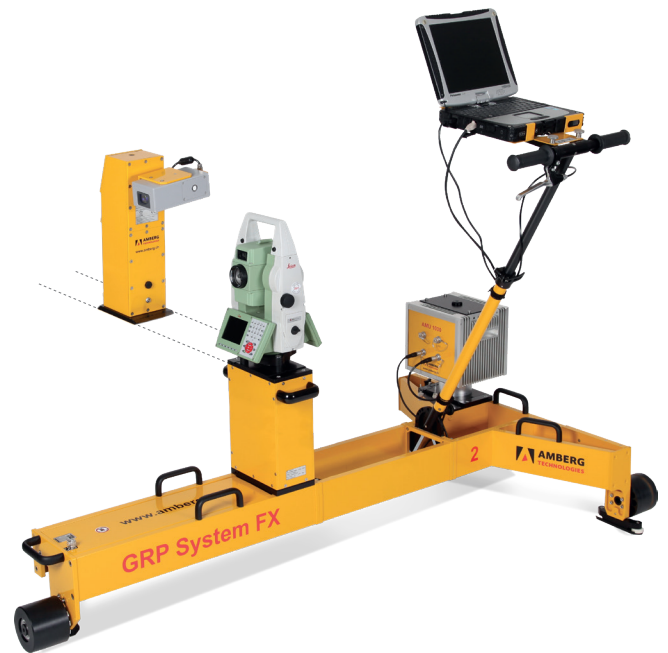
Front: Amberg IMS 1000 with tachymeter Back: Profiler I 10 FX for Amberg IMS 3000